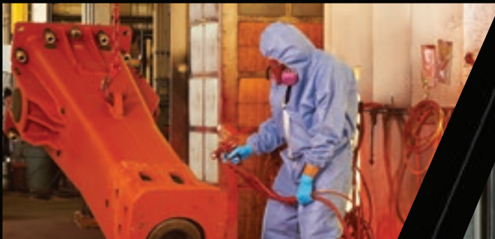
High Volume Low Pressure (HVLP) paint booths use environment-friendly acrylic enamel paint in spraying components for most products.

All REMAN hydraulic hammers, even the largest, and Ho-Pac® vibratory compactor/drivers are tested in Allied's in-factory test booth before shipping.