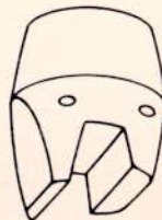
TIMBER SHEETING ATTACHMENT